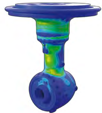
Structural optimization and verification by advanced simulations