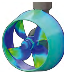
Hydrodynamic optimization by CFD simulations