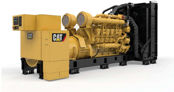
Image shown may not reflect actual configuration